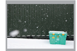
Christmas cards £3.99 for a pack of twelve cards